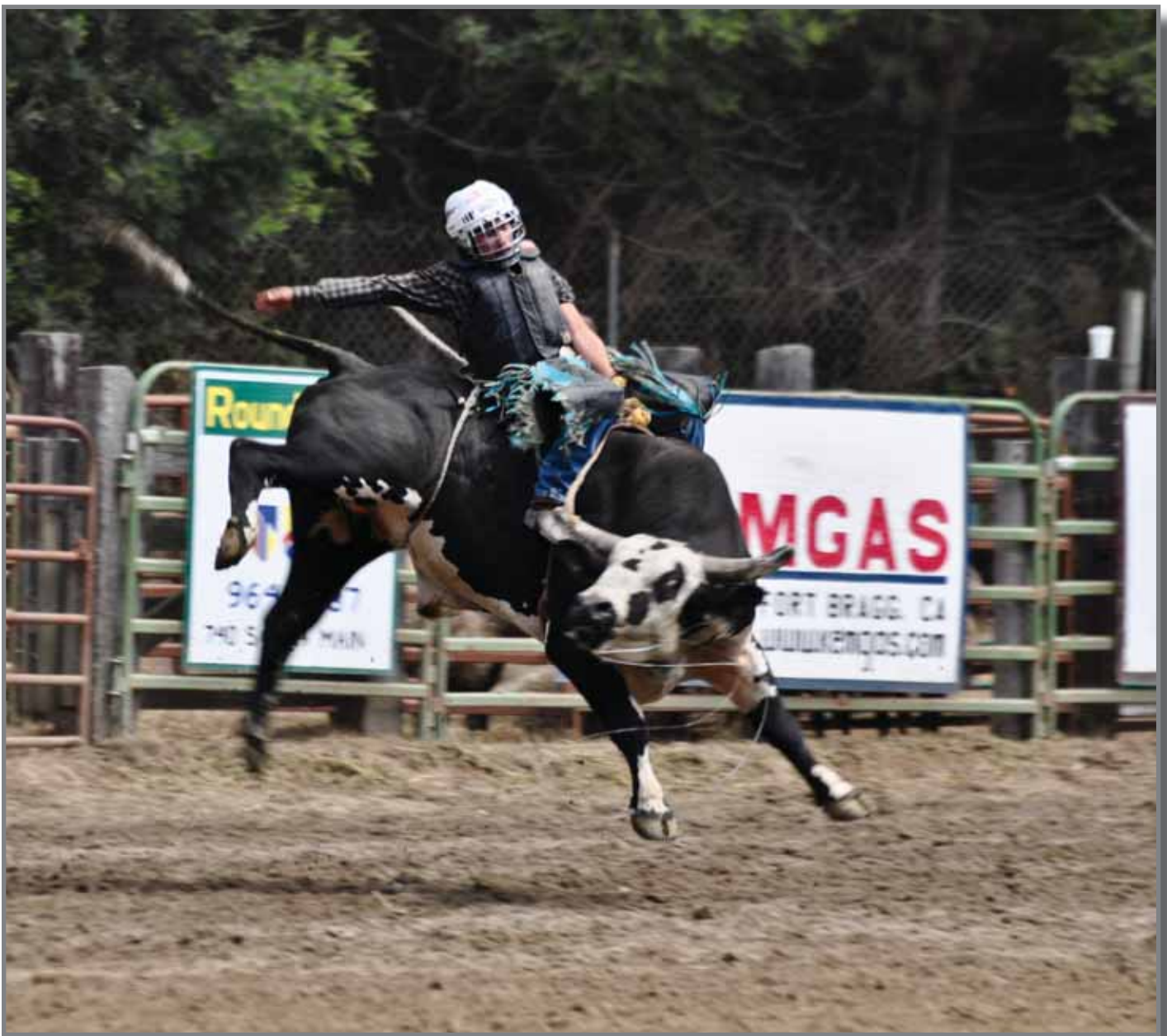
BULL RIDING —Bull riding at the 2012 Shoreline Riders rodeo Saturday and Sunday, July 28 and 29. (SPORTS)