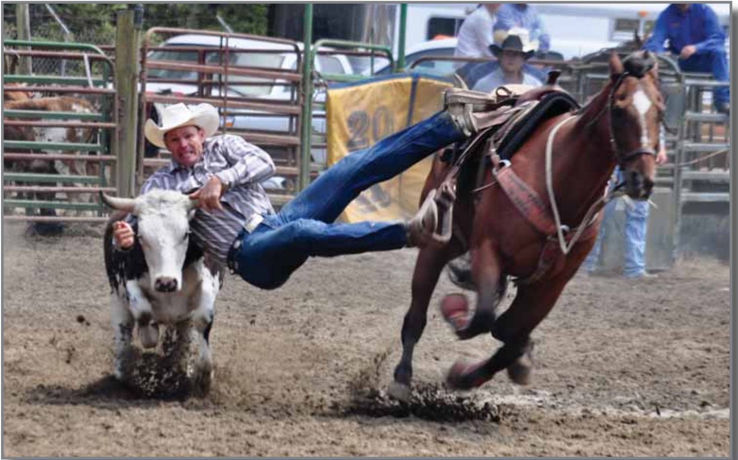
STEER WRESTLING —Steer wrestling at the 2012 Shoreline Riders rodeo Saturday and Sunday, July 28 & 29. (SPORTS)