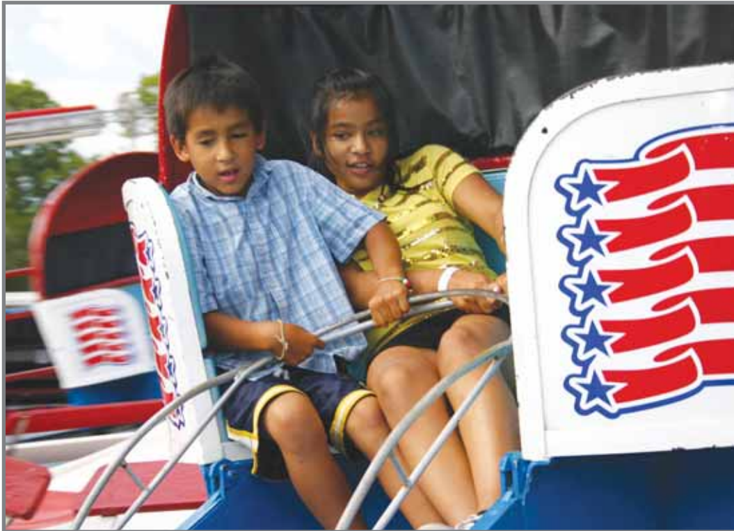
CLEVELANDS AT THE FAIR—?????. (FEATURE)

PAT MCKNIGHT | BANNER JOURNAL, BLACK RIVER FALLS, WI