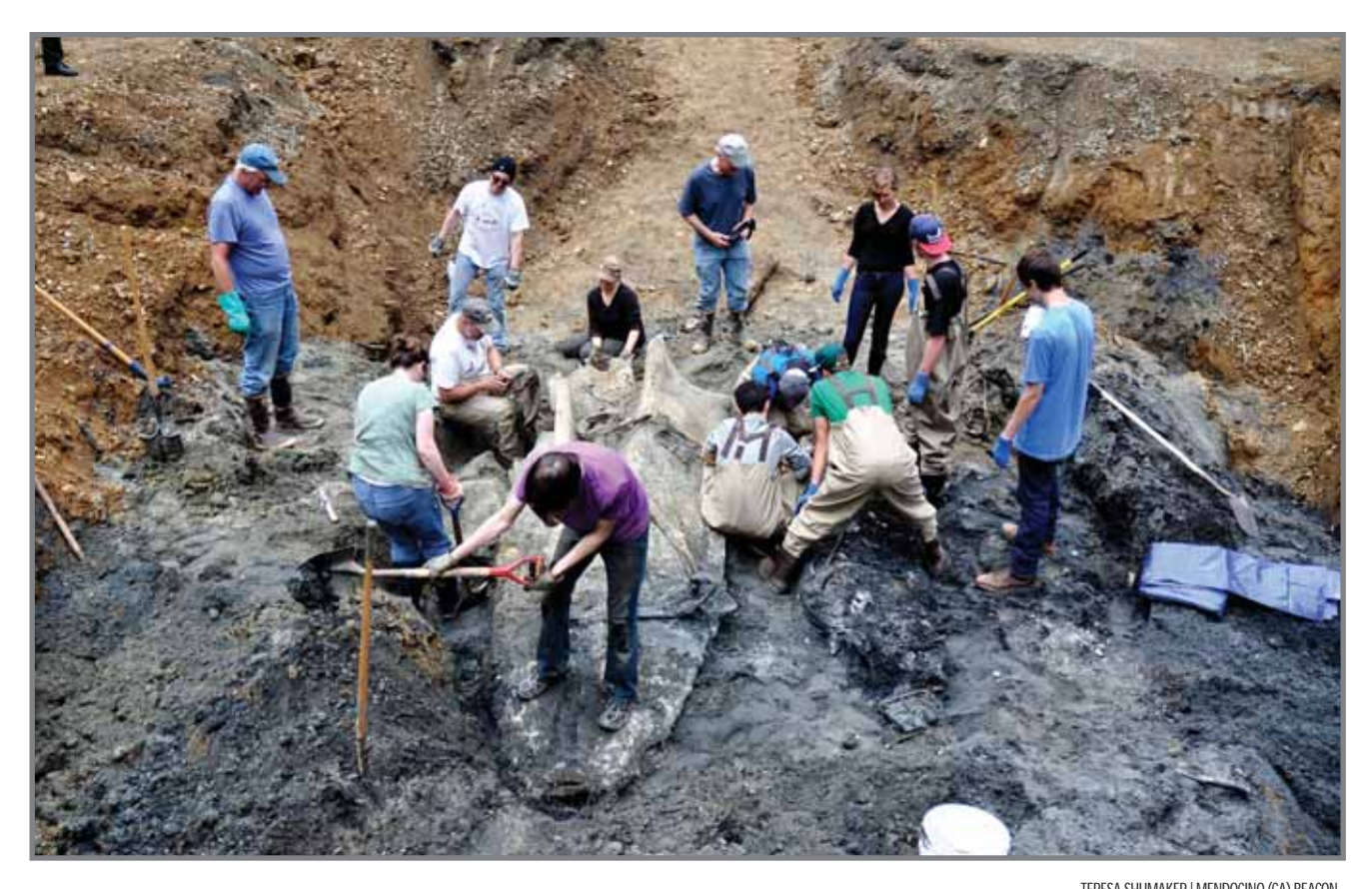
WHALE—Twelve Mendocino High School students help biologists unearth the bones of the blue whale that died in October 2009 after it collided with a research vessel. The skeleton will be transported to a warehouse where it will be cleaned as funds are raised to build the Noyo Center for Science and Education in Fort Bragg, CA. Once assembled, this will be the sixth complete blue whale skeleton in the U.S. (FEATURE)